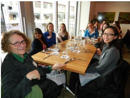
12 noon -1:30 p.m.: LUNCH & Business Meeting