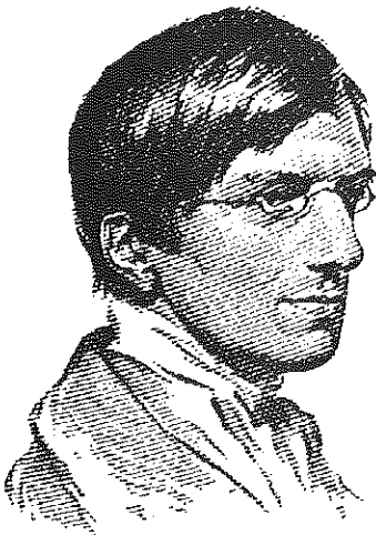
John Henry Cardinal Newman

8:00 p.m. Saturday, April 1, 2000 Foellinger Great Hall Krannert Center for the Performing Arts